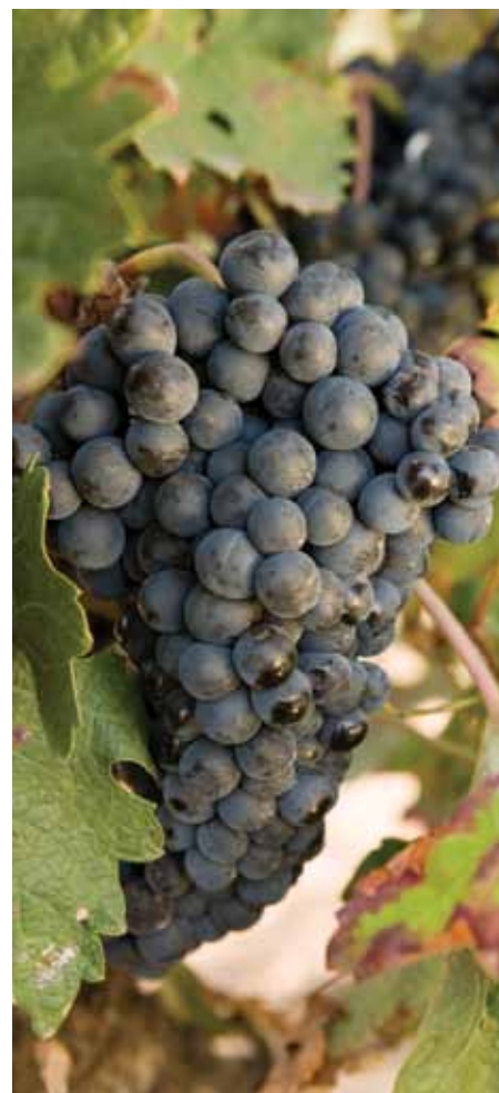
Rombauer Wines typify the uncompromising Napa Valley approach to winemaking in which nothing is spared in the pursuit of consistent quality

tion that can be used to interpret the effect of infrared light passed through a sample of wine or must. He then came across FTIR again while on another assignment in New Zealand, but this time the technology came in the form of the new OenoFoss analyser.